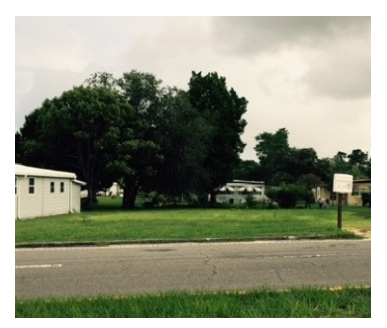
Cat house? What cat house?

We ask that each club assign a representative (or 2) from their group to be present at this MUST ATTEND meeting. We are making this announcement well in advance of the event so that you can come to the meeting prepared with your plans for the coming season. Please bring club event descriptions for insertion in the new web site which will be up and running at that time.